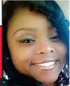
MURDERED JANUARY 2, 2016