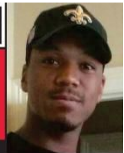
MURDERED JUNE 9, 2014