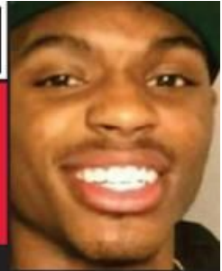
MURDERED MARCH 8, 2016