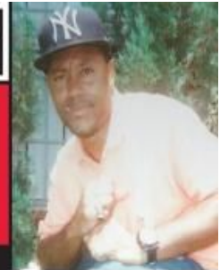
MURDERED MARCH 8, 2013