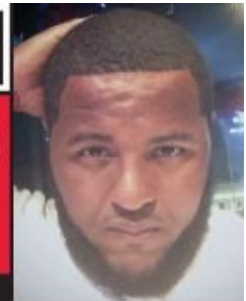
MURDERED JUNE 21, 2015