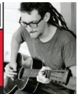
MURDERED SEPTEMBER 23, 2016