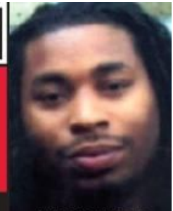
MURDERED JUNE 16, 2012