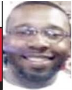
MURDERED SEPTEMBER 30, 2014