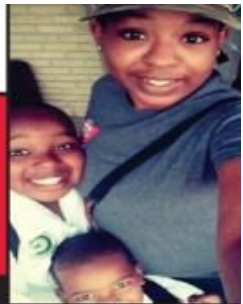
MURDERED MARCH 10, 2017