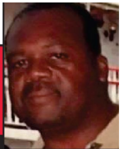
MURDERED JANUARY 23, 2017