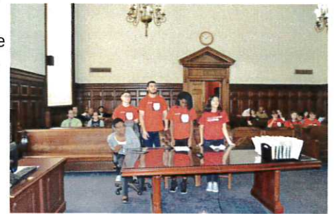
TAAC in the courtroom for a Mock Trial session.