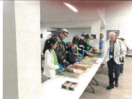
Service Project at the New Orleans Mission.