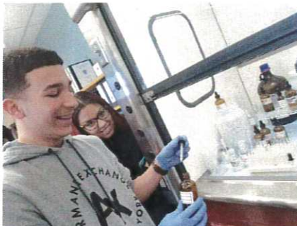
TAAC Meeting at the Jefferson Parish Crime Lab.