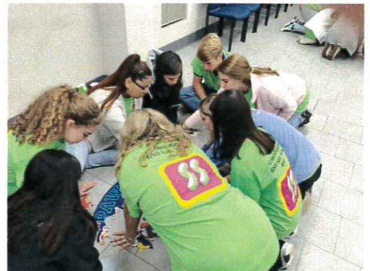
TAAC Members completing a team building exercise.