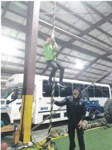
TAAC meeting at NOPD Special Operations Unit.