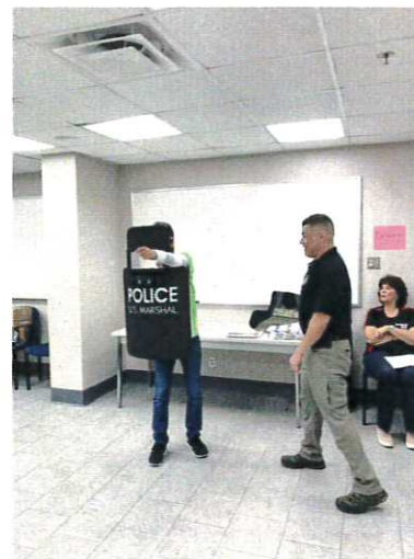
TAAC meeting with US Marshals.